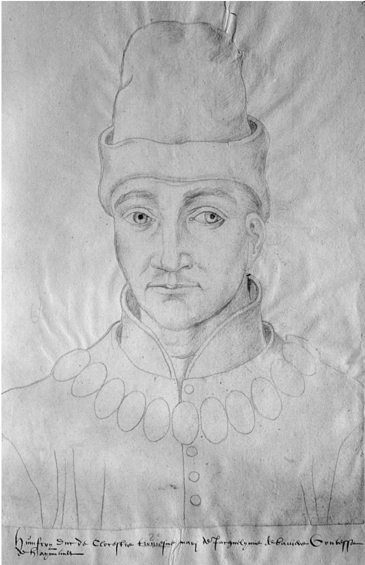
Fig. 1. Humphrey de Gloucester.